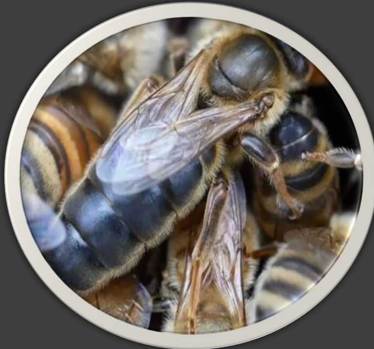
II STAGE Mother bees purchasing