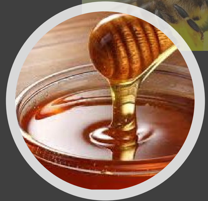
III STAGE Expansion of honey production