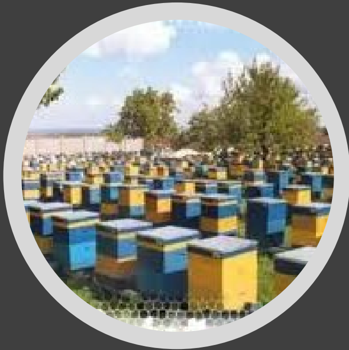
I STAGE Beehives development & Training